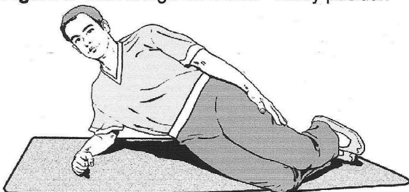
Figure 3 Side bridge on knees - elevated position